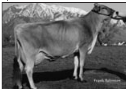
Special Heifers - Read To Go & Show