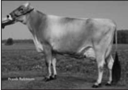
The 'W' Family - Awesome Dec. Legacy

Sending the BEST December Calf from Round Hill Pre Wishful '2E91' . Backed by multiple AA dams, anchored by Whizzbang '5E93'. Investment pedigree for the wise buyer - loaded with AA potential! Legacy blood works on this family. The name of the calf, Top Acres Garbro WinWin, says it all. You will love her! - Top Acres & Garbro, OH