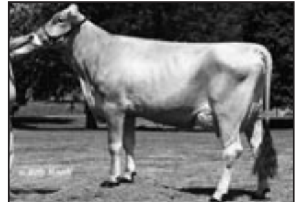
Sweet Dec 09 Jetway (M) Snick Family