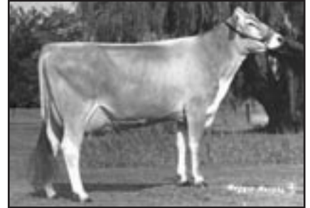
Big Agenda Ready To Show

Hoosier Knoll Ballet '3E91' is 2nd dam of this special Sept '09 Agenda. Dam is a fancy 'V86' Jetway (M). Show potential here! Also sending fancy Dec. '09 Dallas from a 2y Turmoil out of a Jetvin, then Possibly Priscilla - The "P" Family. AND selling (4) Agenda embryos out of Dublin Hills Sasha '2E92' Elite. With a 'E95' in frame, make some great ones! - Dublin Hills, MD