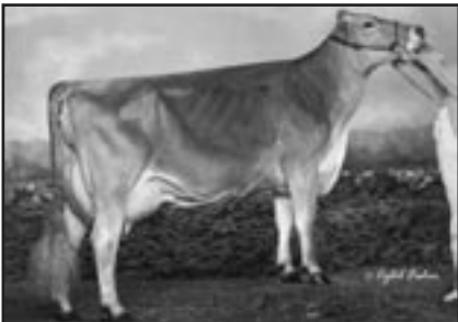
Great Cow Families Combined-WOW!