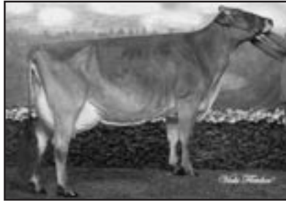
Fancy September Denver x Tootie

A super September '09 calf by Denver from GS Ensign Tootie '2E94' , Nat'l Total Performance, Nom & Res. AA Comp. Merit Cow and plenty of show winnings! Fancy calf for a smart investment in a famous cow family! Tango is her name - Let's Dance! - Round Hill Acres, MD